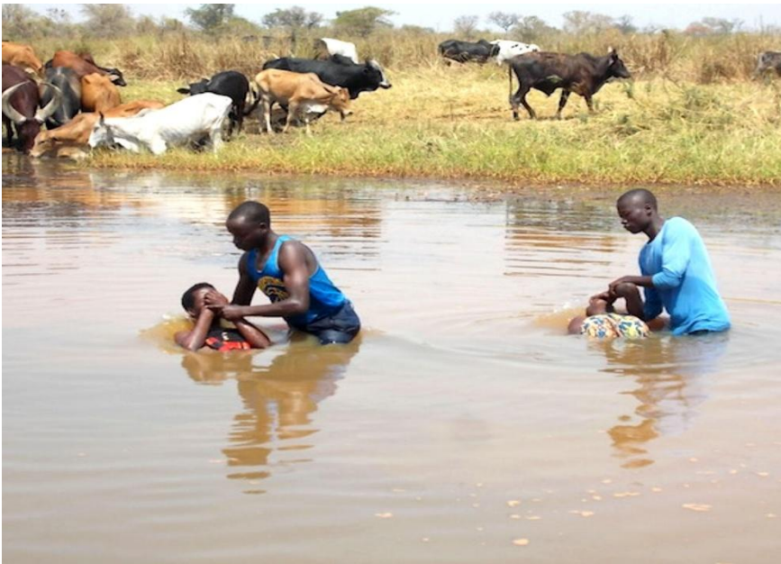
Pastors baptizing in crocodile infested rivers.